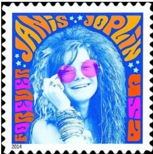
Memorialized on a US Postage Stamp in 2014, Janis Joplin had an unmistakable passion for the blues.